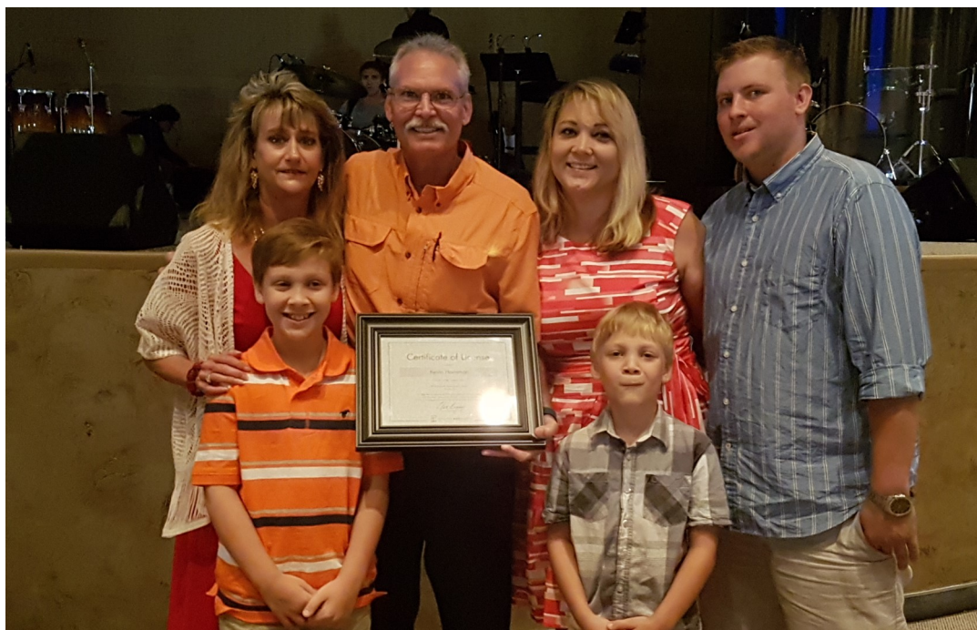
HNW Licensing with the family